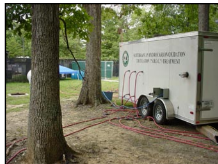
MOBILE INJECTION UNIT

The subsurface formation consisted of silty sands with intermittent cobble and gravel deposits.