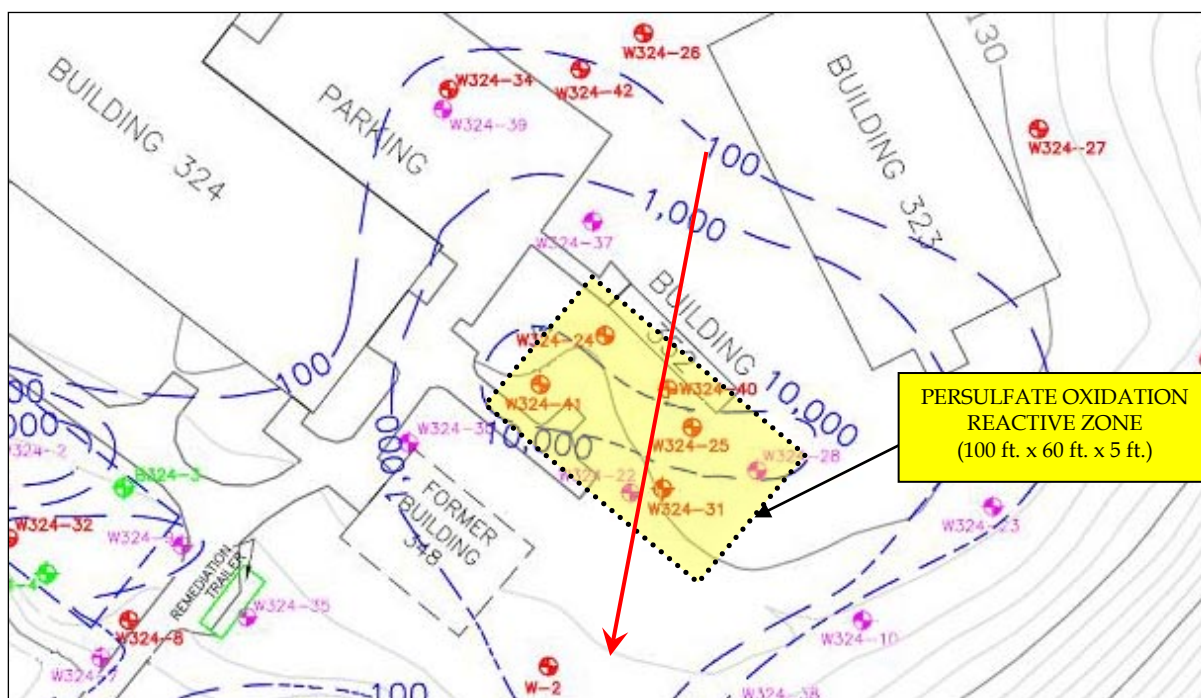
TOTAL BTEX BASELINE CONCENTRATION ISOPLETH MAP WITH PERSULFATE OXIDATION REACTIVE ZONE; AND HISTORIC GROUND WATER FLOW DIRECTION.

Monitored well W324-40 demonstrated a significant BTEX concentration increase during the 100-Day sampling event; indicating the need for persulfate reactive zone expansion to include areas beneath and upgradient of building 352, suspected of additional BTEX impact.