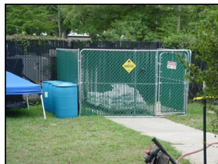
CHEMICAL STAGING AREA.